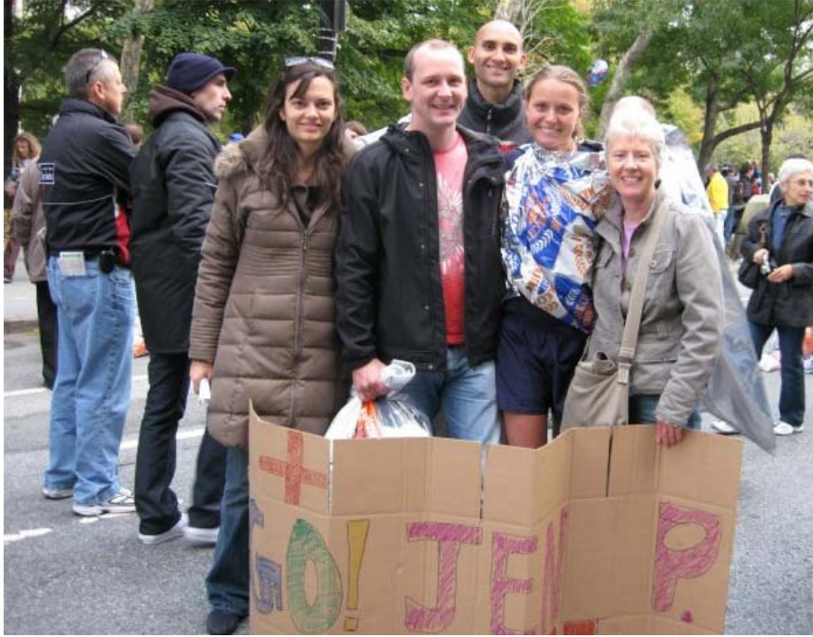
The ING New York City Marathon - November 4th 2007